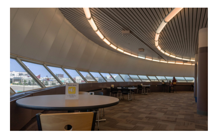
Downtown Main Library

The Duluth Library Foundation champions the Duluth Public Library and works to increase it's capacity to serve the region.