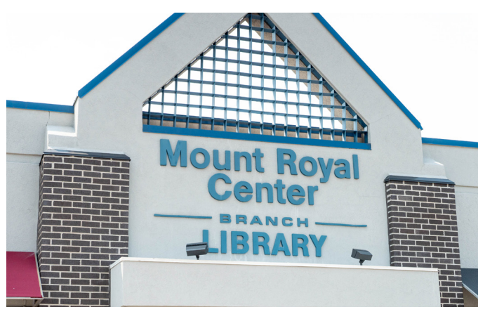
Mount Royal Branch Library