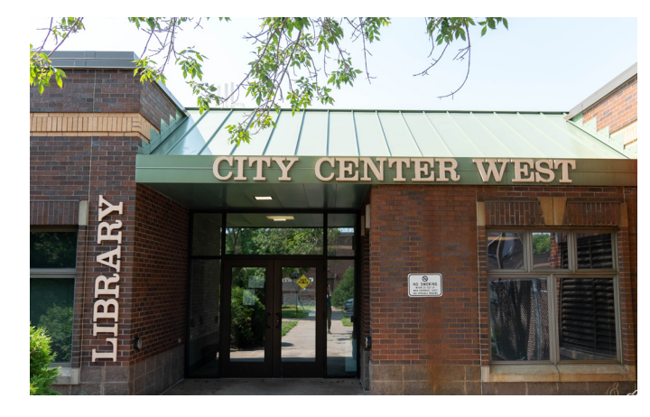
West Duluth Branch Library